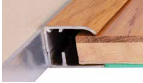
Prestige Profile border * Size: 3400 x 27 x 7-18 mm