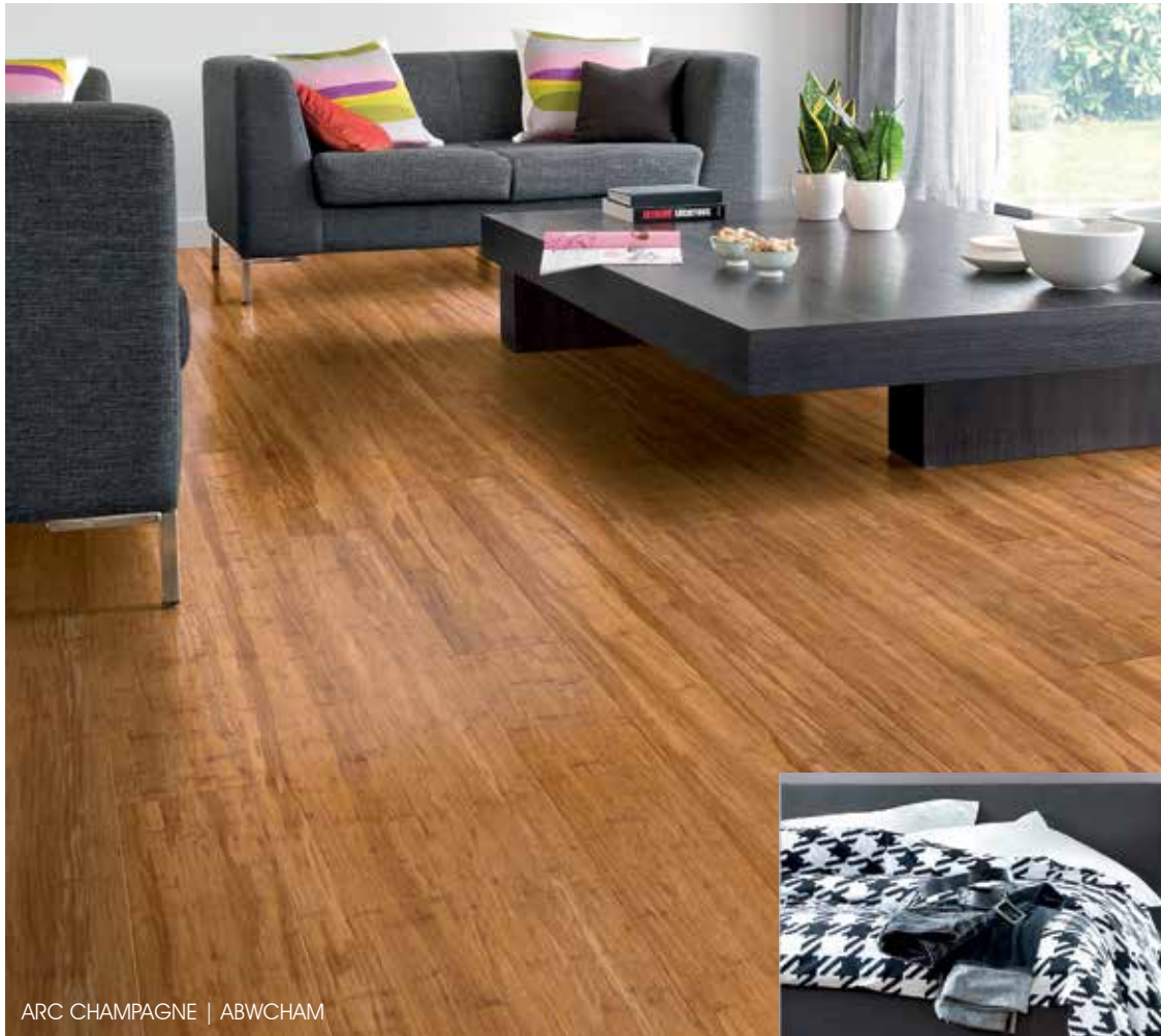
ARC CHAMPAGNE | ABWCHAM