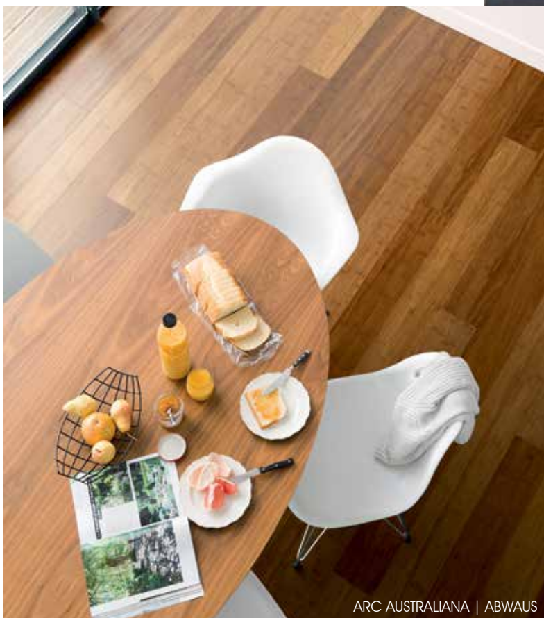
ARC AUSTRALIANA | ABWAUS