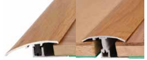
Prestige Profile universal * Size: 3400 x 45 x 7-18 mm