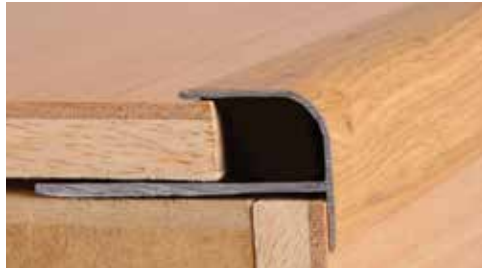
Prestige Profile stair * Size: 3400 x 21 x 14 mm