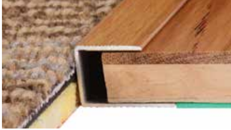
Prestige Profile end * Size: 3400 x 45 x 14 mm