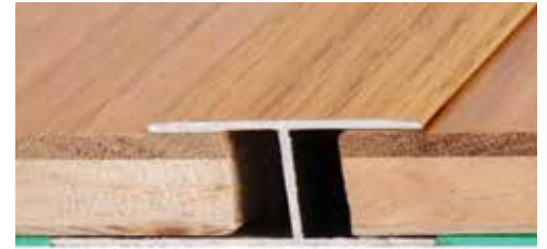
Prestige Profile H-trim * Size: 3400 x 27 x 14 mm