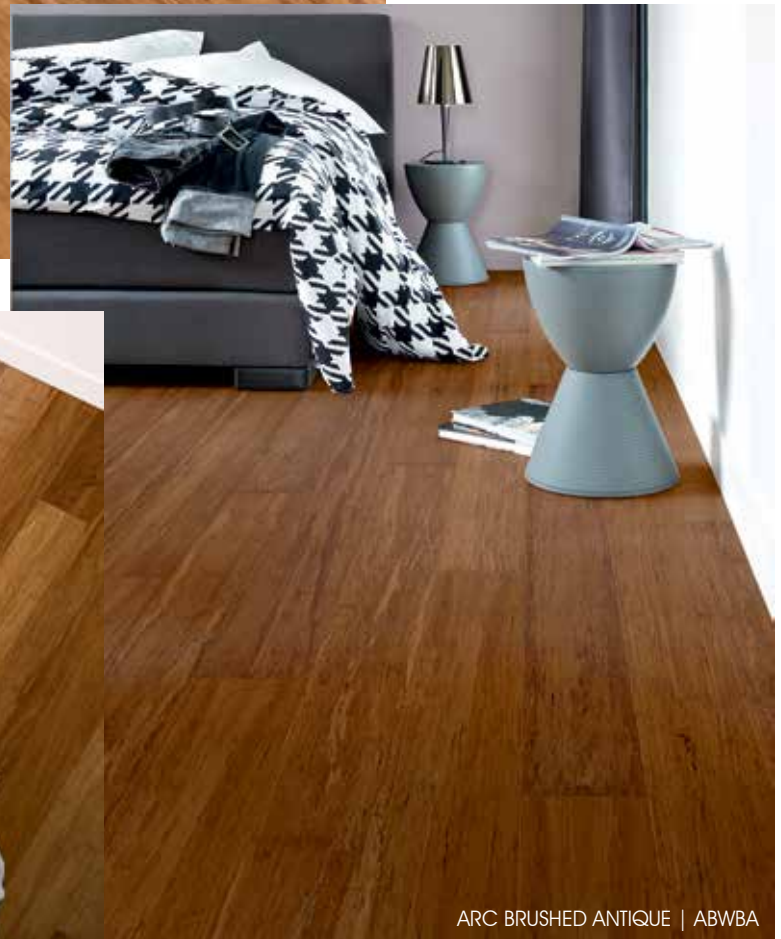
ARC BRUSHED ANTIQUE | ABWBA

Just have a look at our Australiana Bamboo: thanks to the wide planks, the natural variation almost resembles the real look of the popular timber species Spotted Gum.